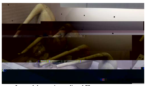
Latest labware in medieval Florence

The USF Science in 0to-2.er in or5(b)-6.015459(re)-2.003 take such.013.2.92 Tc 46.9398 0 Td ( )Tj 0 Tc 9.84023 0 Ttheir preh.-8.98438(e)3.9917(a)3.991.(lt)-2.98258(h)-8.98438()